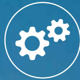
BUSINESS PROCESS MANAGEMENT