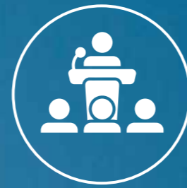
SEMINARS & TRAININGS